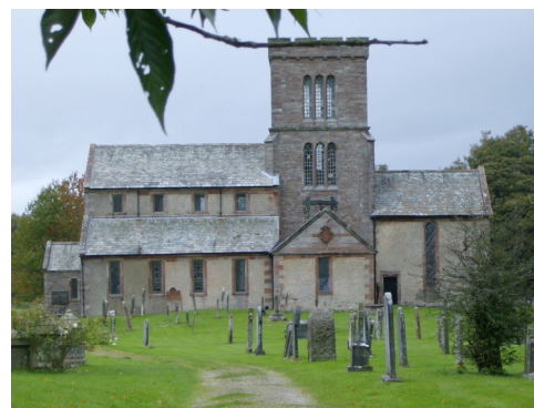
St. Michael's Church, near Askham, Cumbria, England. Built on the site of a 13th Century Christian Church, the present building was built in 1686 near the Lowther Castle, the family seat of the Earls of Lonsdale

The Initial in Their Excelencies' Letter is from Freeceltic's Celtic Art, Letter type 2. Others like it can be found at http://www.freeceltic.com/celtic-celtic%20letter%20type2-00.html .