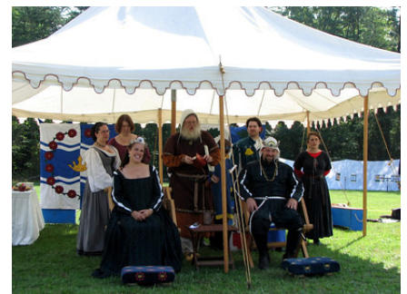
Their Majesties, Sinclair and Kari's last Court at Chalice of the Sun God V/Coronation in Ponte Alto.

We are now in need of a new Chatelaine. We are also still in need of a Minister of Minors (MOM), even if it's just to cover Birthday.