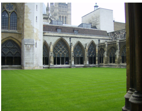
The Cloister at Westminster Abbey.