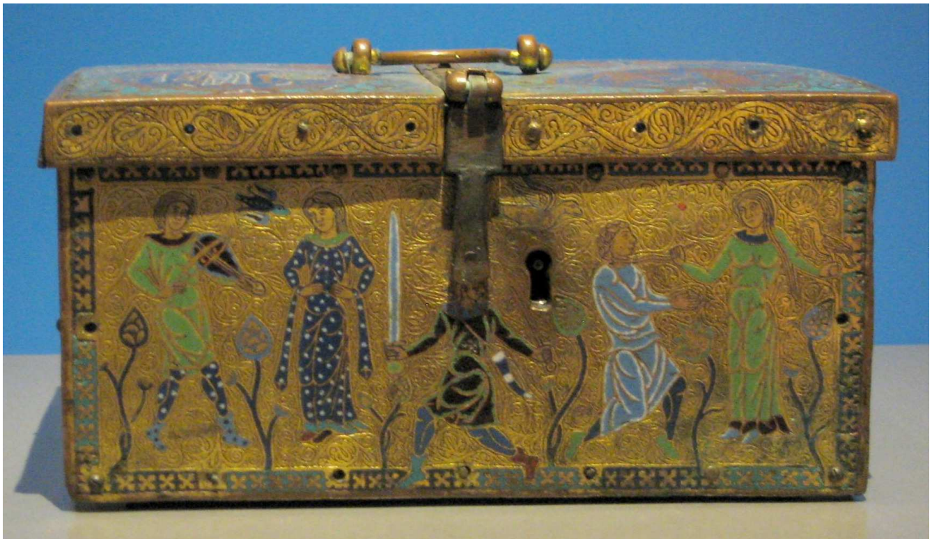
Casket with scenes of courtly love, from Limoges, France, c. 1180. British Museum, London

http://archive.org/details/ancientmodernshi00holmuoft