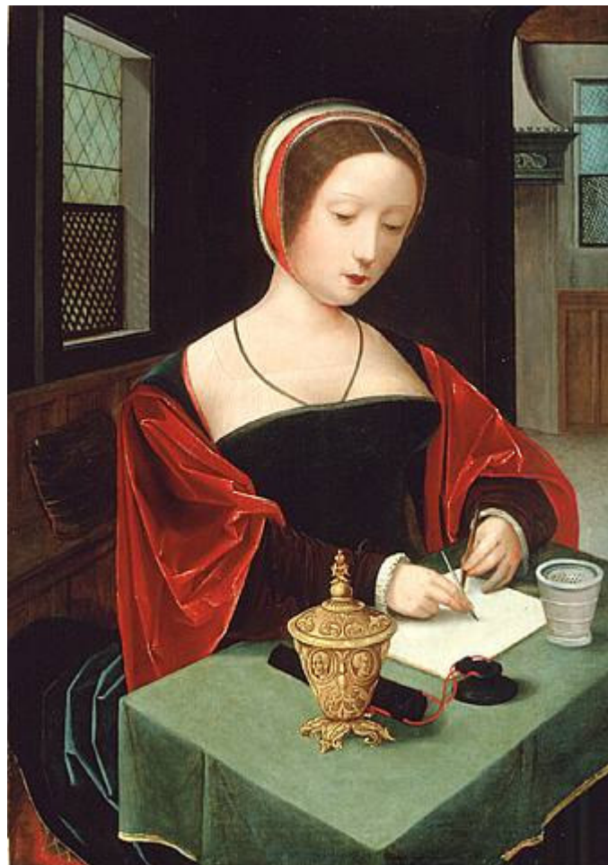
Saint Mary Magdalene at her writing desk. Artist: Master of the Female Half-Lengths 16th Century