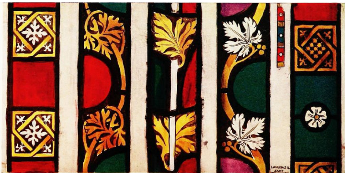
Borders from window with life of St. Gervais, from south choir aisle, St. Ouen, Rouen. 14th century

http://archive.org/details/cu31924020532879