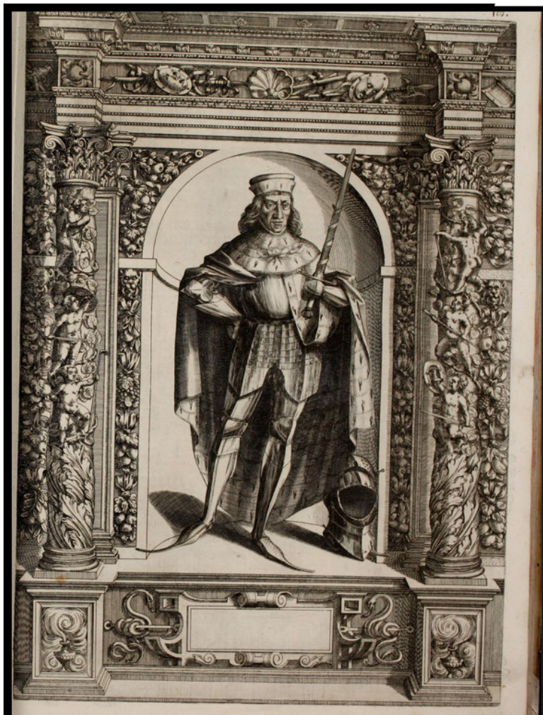
Frederick, Count Palatine of the Rhine & Duke of Bavaria

serenissimorum regum, atque archiducum, illustrissimorum principum, necnon comitum, baronum, nobilium, aliorumq[ue] clarissimorum virorum, qui aut ipsi cum imperio bellorum duces fuerunt, aut in iisdem praefecturis insignioribus laudabiliter functi sunt, verissimae imagines, & rerum ab ipsis domi, forisq[ue] gestarum succinctae descriptiones. Quorum arma, aut integra, aut horum partes, quibus induti, vsique aduersus hostem heroica facinora patrarunt, aut quorum auspiciis tam prospera quam aduersa fortuna res magnae gestae sunt, à serenissimo principe Ferdinando, archiduce Austriae, duce Burgundiae, comite Habsburgi & Tyrolis &c. ex omnibus ferè orbis terrarum prouinciis partim conquista, partim ab illorum haeredibus & successoribus transmissa, in celebri Ambrosianae arcis armamentario, à sua serenitate non procul ciuitate Oenipontana extracto, conspiciuntur