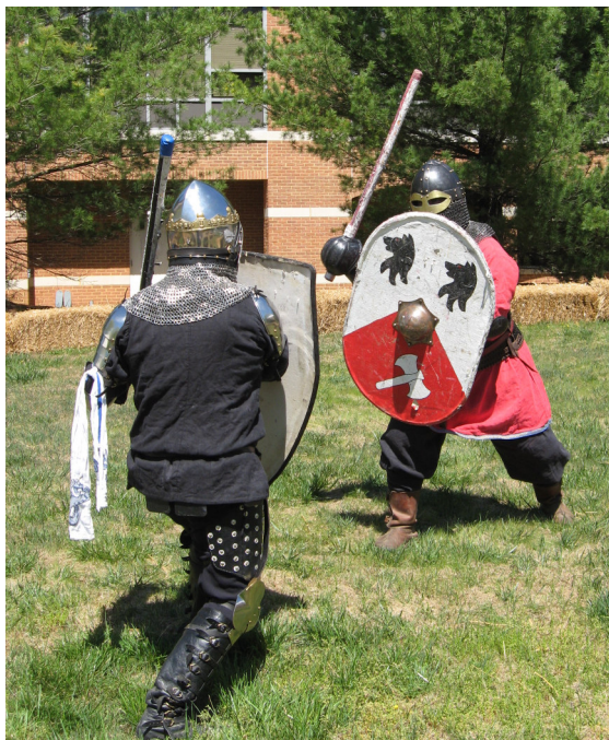
Heavy fighting - Christopher & Erwin