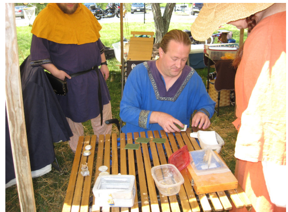
Jonathas metal casting