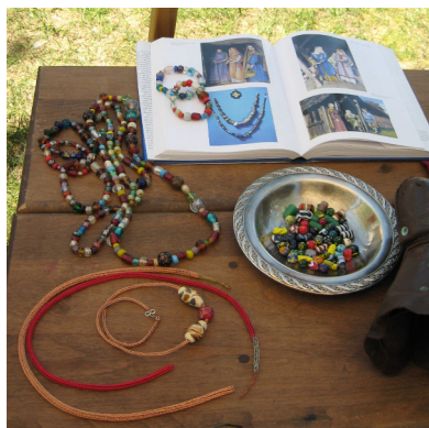
Beads & wirework