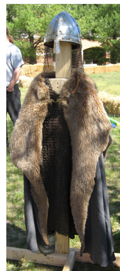
Erwin's viking armor