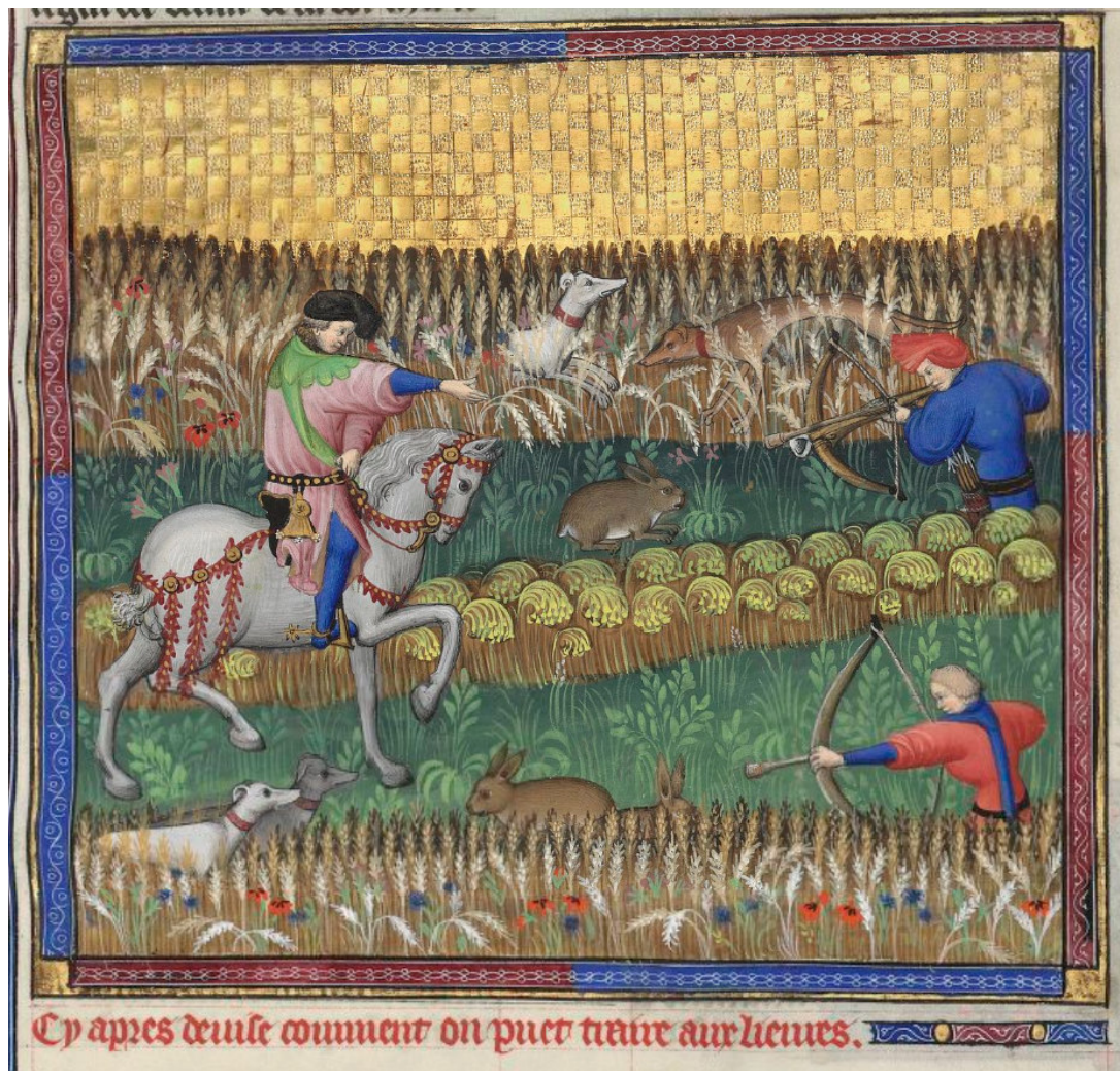
Shooting hares with blunt bolts. From "Livre de la chasse" folio 118r.