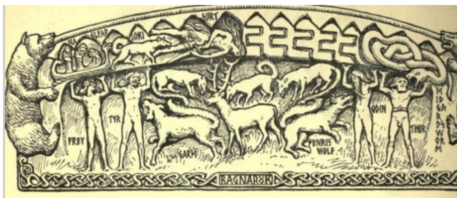
Ragnarok (from the Heysham Hogback)