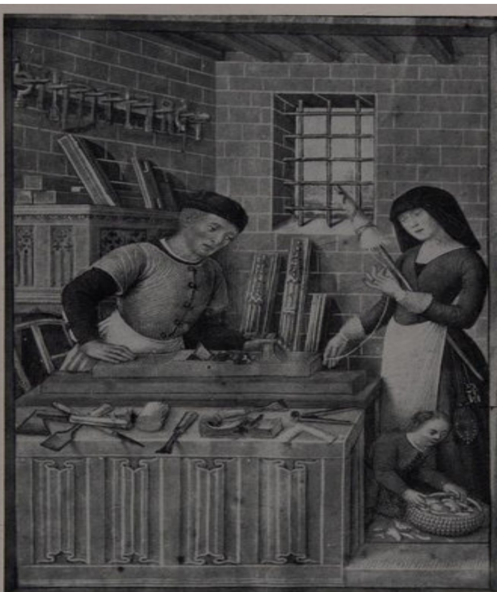
51. THE ARTISAN

https://archive.org/details/bwb_S0-BSI-952